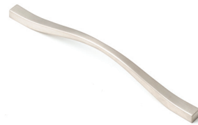
Dull Brushed Nickel